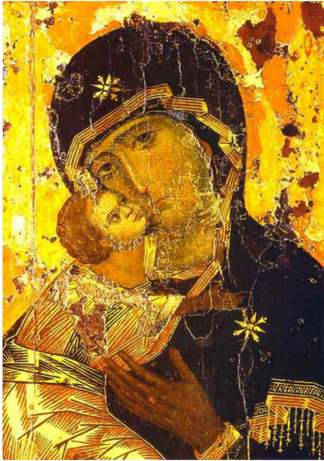
The Theotokos of Vladimir Theotókos = "Birth-Giver of God" = Mother of God