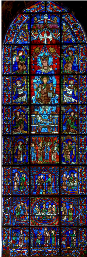
Notre Dame de la Belle Verriere