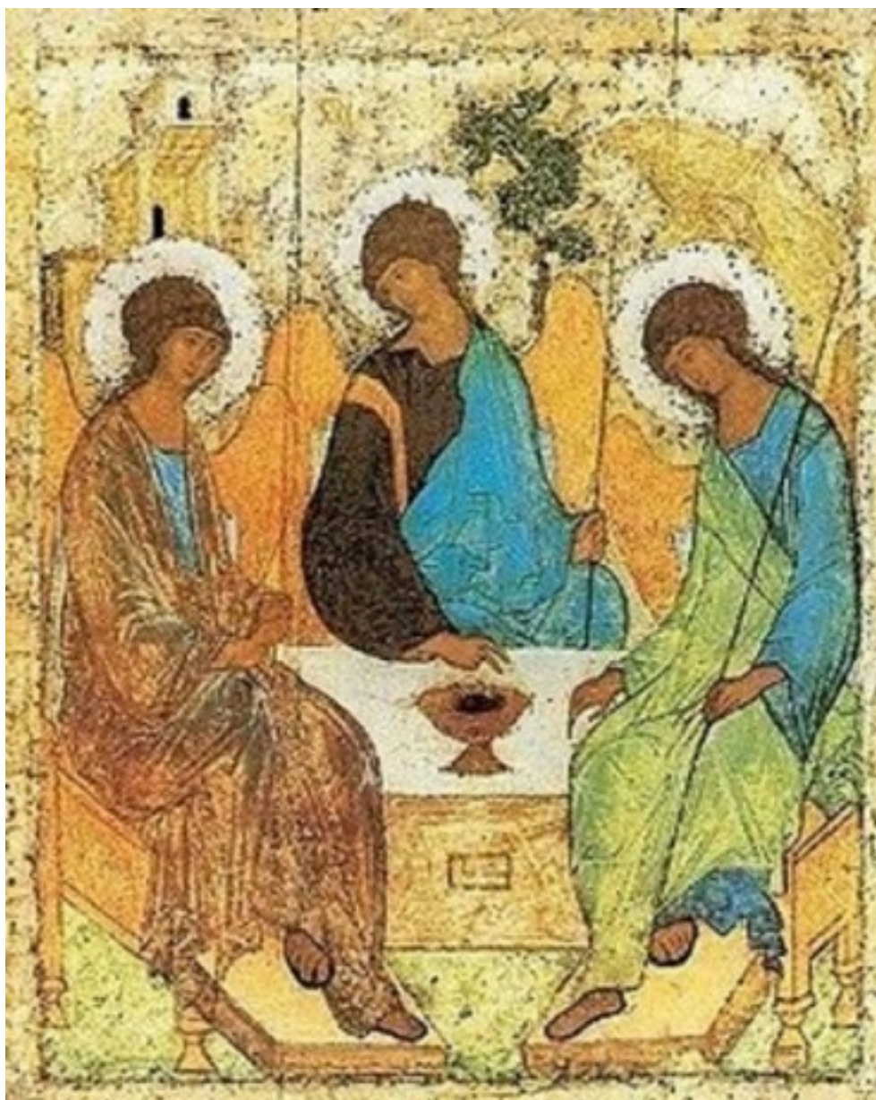
The icon of the Trinity - painted by Andrei Rublev(1360-1430) - currently held at the Tretyakov Gallery in Moscow.