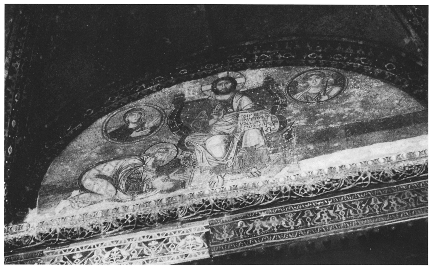
1 Narthex mosaic, St. Sophia, Istanbul

Much of the discussion of this mosaic has centered on the question of the identification of the emperor seen kneeling in the icon and the consequent intentionalist readings of the work. Rather than becoming directly engaged in this debate, I will discuss the panel here as an example of the pictorial possibilities in post-iconoclastic art.